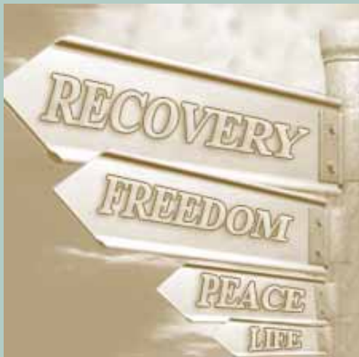
The Clients and the Treatment Always come First.